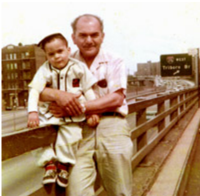
On my second B'day May 28, 1965. My Abuelo was my idol and role model.