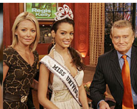
Audio Interview 1