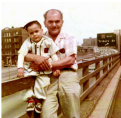
On my second B'day May 28, 1965.