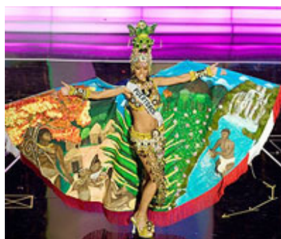
This costume says it well, with it Zuleyka was crowned Miss Puerto Rico and now Miss Universe 2006.

Zuleyka's victory is one dear accomplishment for her, for my tiny island, and for all Latinos. Zuleyka is the result of people acting on love. Zuleyka is the poster face for the Latino image, she represents our heritage, and our diversity. Wow! From the start Zuleyka blasted everyone away. Zuleyka is a country girl from our mountains down to our southern coast. I can go on and on about this and I'm just speechless about her. Another JLO is one the way. Godbless Zuleyka, her parents, and grandparents. Also, Zuleyka as a sample of the entire spectrum of Latin Beauties check out this gallery . When people of different races come together the results can be astonishing. Diversity is hot. Segregation is boring. Spice yourself. Bring color into your life. Visit my island. Embrace our language. Salsa dancing is the key. You will never regret it. Music is an important ingredient of our diversity, listen to this Music Mix